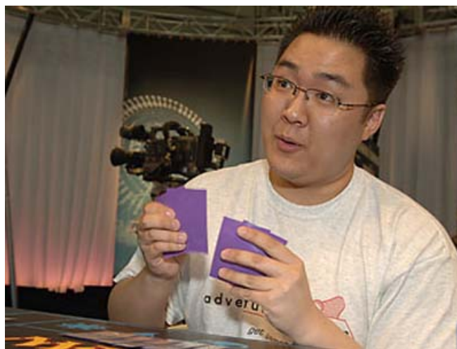
Without traveling too much, Cheon is in the thick of the race.