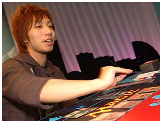
Saito has picked up at least one point at each tournament since Valencia.